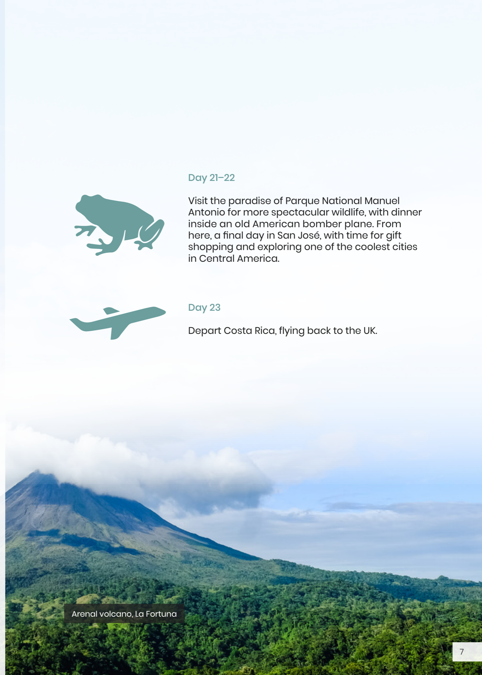
Arenal volcano, La Fortuna

Depart Costa Rica, flying back to the UK.