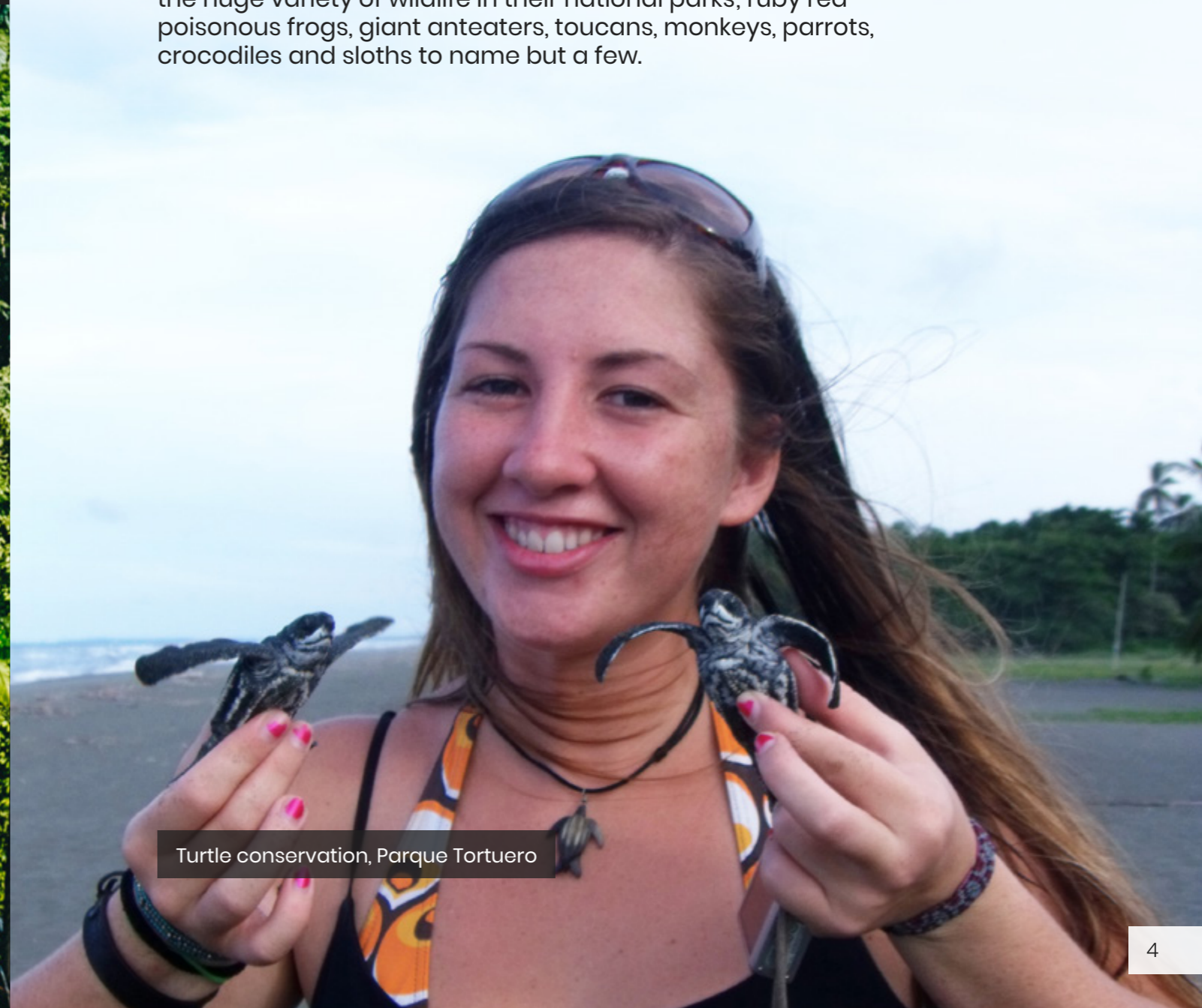
Turtle conservation, Parque Tortuero

We are also able to see first-hand the positive impact of the country's long-term biodiversity policy and experience the huge variety of wildlife in their national parks; ruby red poisonous frogs, giant anteaters, toucans, monkeys, parrots, crocodiles and sloths to name but a few.