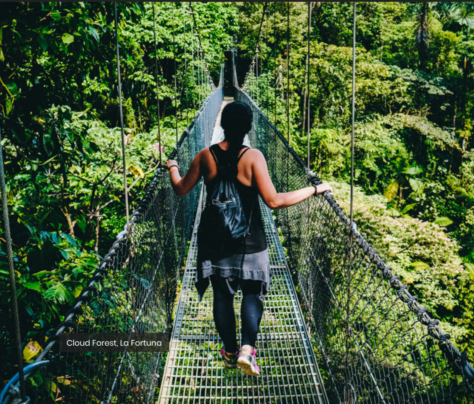
Cloud Forest, La Fortuna

Costa Rica has twenty national parks and eight biological reserves, filled with exotic birds, insects and animals. Dynamic Adventures will plan the trip together with the students, deciding the best places to explore and things to see along the way.