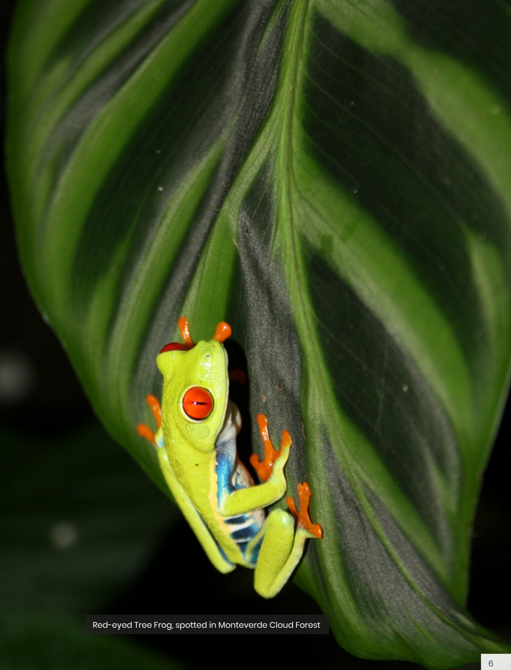
Red-eyed Tree Frog, spotted in Monteverde Cloud Forest

Costa Rica is a stunning and exciting country with lots to be discovered. This is a genuine once in a lifetime opportunity to experience a spectacular part of the world, assist in crucial wildlife preservation projects, and support wonderful local communities. We know from experience that this will have a lasting positive effect on the group, as well as the people they visit.