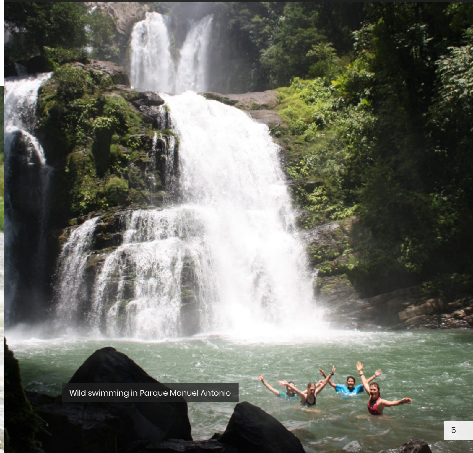
Wild swimming in Parque Manuel Antonio

After all the excitement, there is ample time to unwind, swim and relax on the beaches of the Pacific Ocean. Building sand sculptures, snorkeling in the sea, surfing, enjoying fresh tropical fruit salads, and cups of real Costa coffee, before heading home.